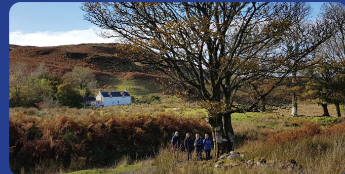
Small tour group