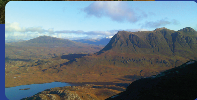
Splendid Wester Ross-a different world

Hadrians Wall special. The Romans came to these islands two thousand years ago. They divided the Britons by building this huge construction which ran 60 miles across the country to control who and what left and entered the empire. The wall never was part of the border between England and Scotland-indeed these two names were unknowns of the future when the Romans were around.