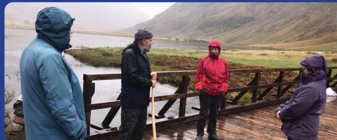
Guide and guests: no wrong weather-just wrong clothes

Bespoke, private and small group tours of Scotland & the Borderlands.